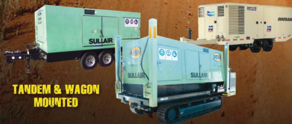
TANDEM & WAGON MOUNTED

From a single compressor to a complete drilling solution, MEH has an air package for rent. And it's backed by over 40 years of industry experience and a total commitment to keeping you moving.